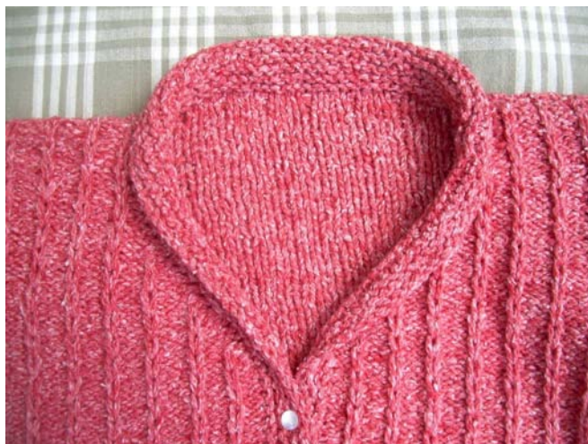
Neckline and collar detail

Model made in O-Wool Balance (50% organic cotton, 50% organic wool) (1.75 oz/50 g per 130 yds/120 m).